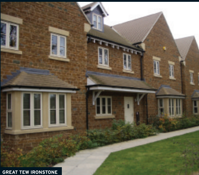
GREAT TEW IRONSTONE

Mainly used for traditional house building from the South of Oxford to the North of Lincolnshire, as well as restoration projects where conservation grade ironstone is required. Reference sites include: Northampton and Oxfordshire areas.