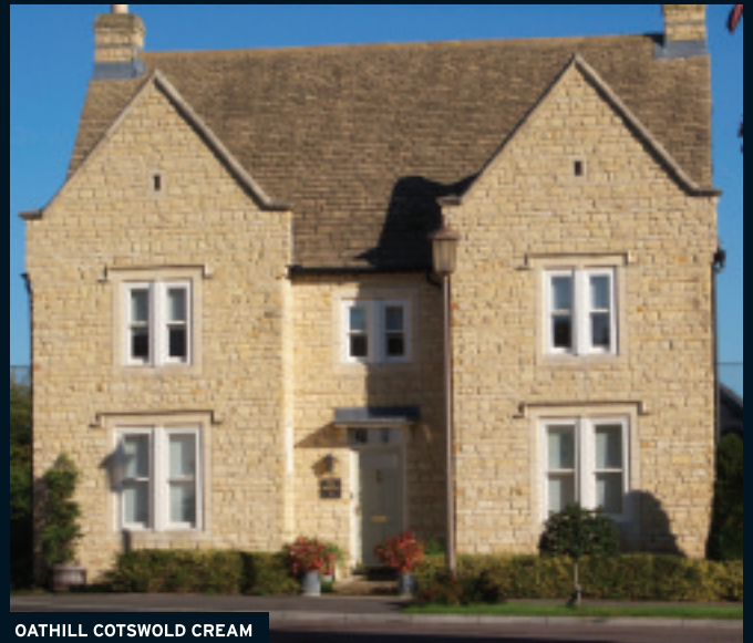
OATHILL COTSWOLD CREAM

Widely used as traditional walling for residential and landscaping project in the Cotswolds. Reference sites include: Chipping Camden, Stow on the Wold, Moreton in Marsh, Burford and Shilton.