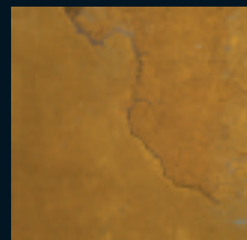
GREAT TEW IRONSTONE