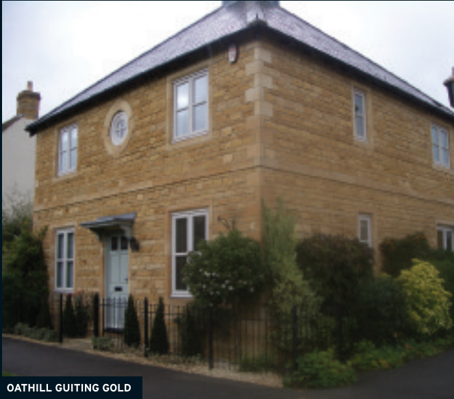
OATHILL GUITING GOLD